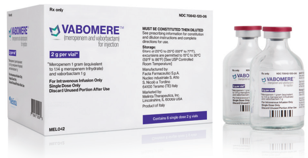
Two vials = 4 g dose