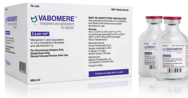
Two vials = 4 g dose